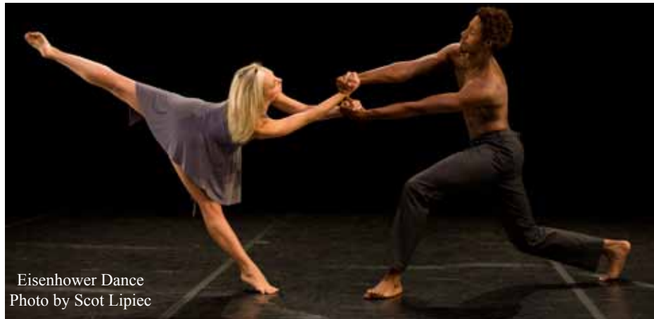
Eisenhower Dance

Full details inside and on the website at http://ohiodance.org/festival/